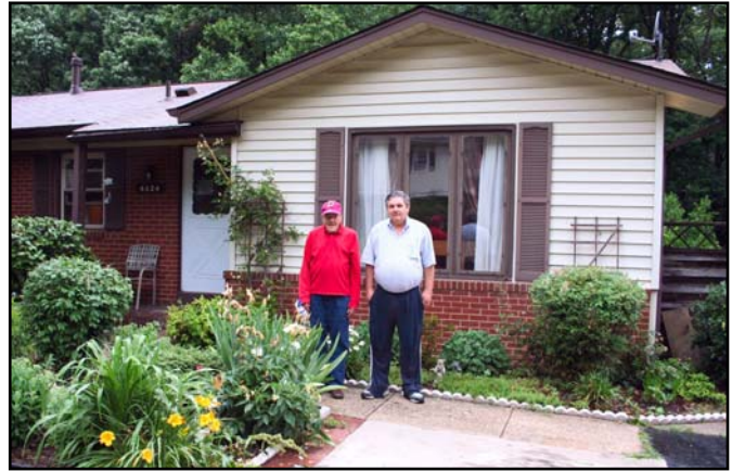
Independence residents enjoy the garden at the new Nashville Woods group home.

Earlier this year GUIDE received notification from the U.S. Department of Housing and Community Development that the organization was selected to receive a grant of $916,900 through the HUD Section 811 program. The grant will fund the development of two group homes providing housing and rehabilitation services to twelve adults who are part of GUIDE's Independence Program in Prince George's County. In April, we were also notified by the Maryland Department of Health and Mental Hygiene that the project would be receiving an additional $276,000 needed to support the acquisition and renovation project. In May, we learned that the additional $40,796 necessary for a fully funded program of $1,233,696 would be provided by a grant from the Maryland Affordable Housing Trust. This will be GUIDE's third 811 development project in the county, and GUIDE was one of